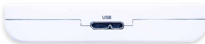
Back view amplifier, power supply and EEG data transfer output via USB 3 (actual size).