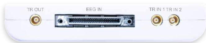
Front view amplifier, trigger in and output and EEG data transfer input (actual size). Trigger out not operational until further notice.