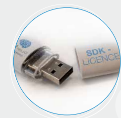
Certified SDK licence